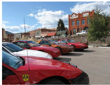
Cripple Creek - 09/13