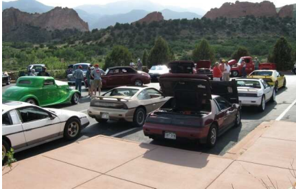
Garden of the Gods - 07/12