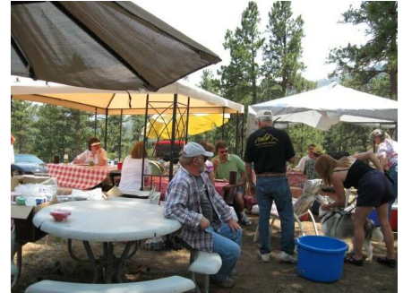
Family Picnic - 07/20