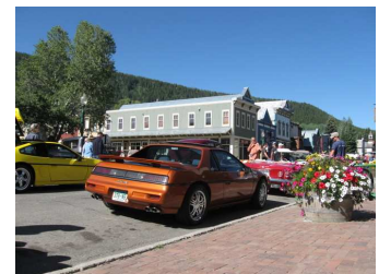
Sunday Breakfast at Crested Butte