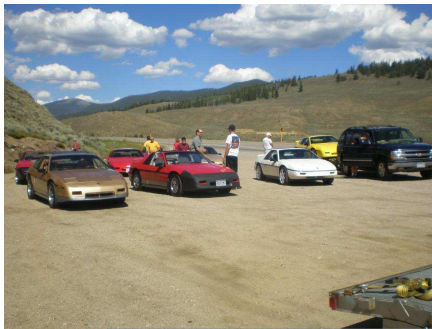
Caravan getting there - taking a break!