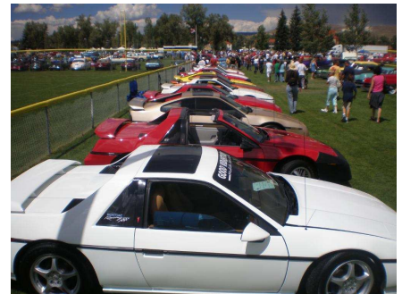
Saturday's Show - the Fiero Class