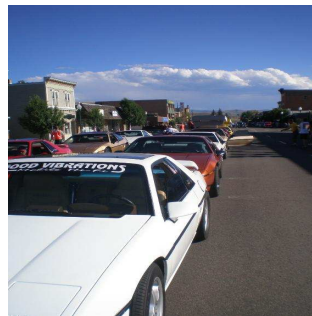
Friday Night Street Dance