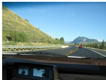
Breakfast Caravan to Crested Butte